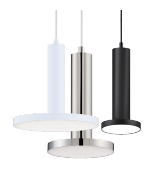
57600 PENDANT ACCESORY