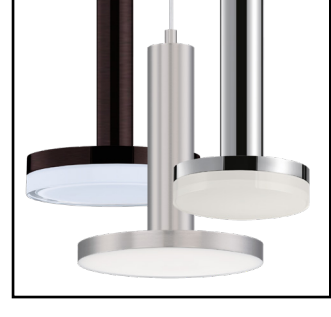
57600 PENDANT ACCESORY (Sold Separately, Fixture NOT included)